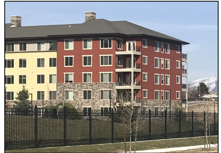
Illustration 7.2.2 Senior Housing.

As seniors become a larger percentage of the overall population, senior oriented housing communities, such as Plymouth View Senior Housing [above] and Summit Vista [below], provide much needed housing oriented towards elderly populations.